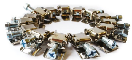
Locking device SU 50 for CBR 3000