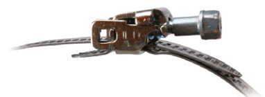
Easy locking mechanism for the CB and CBR clamps